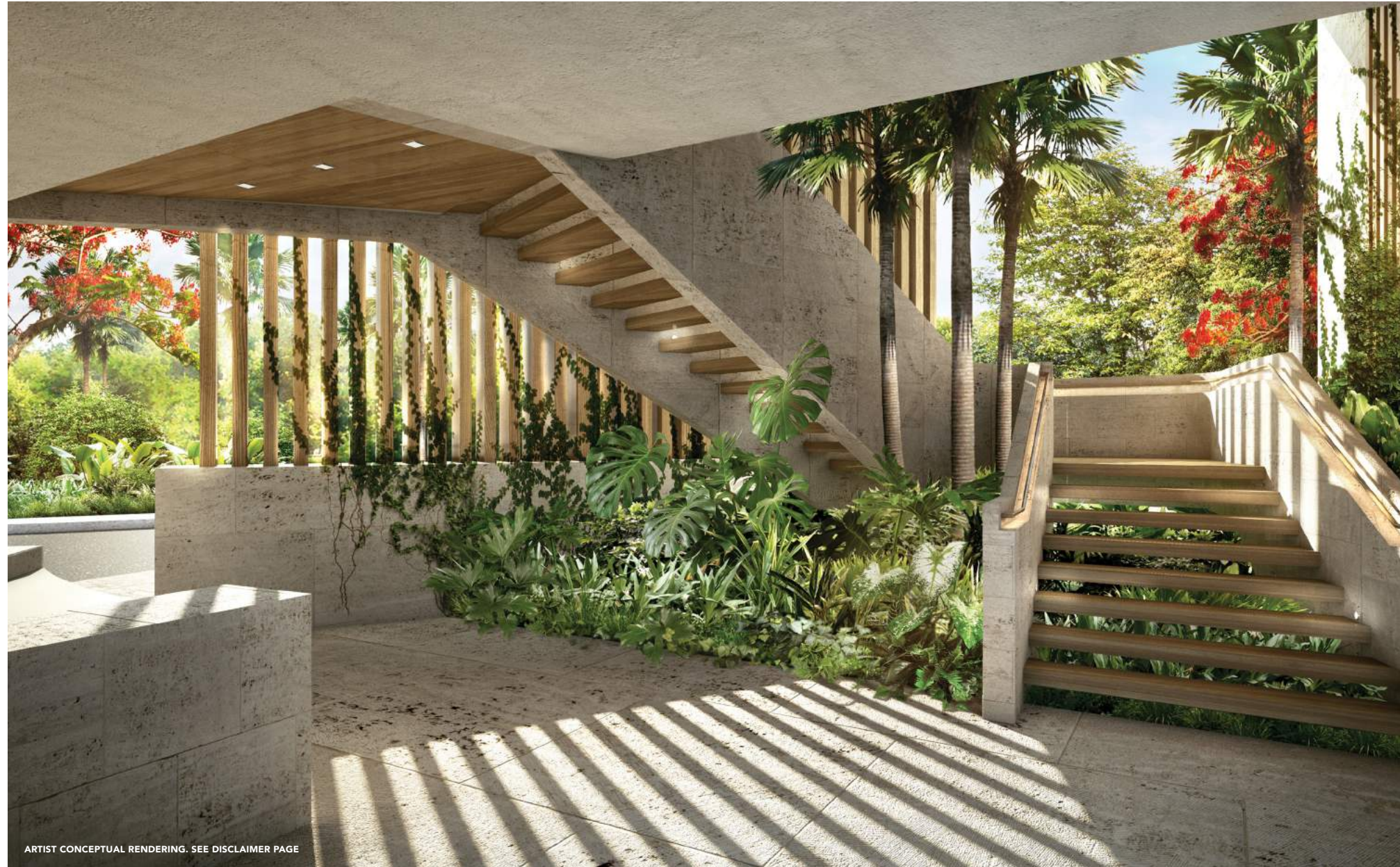
ARTIST CONCEPTUAL RENDERING. SEE DISCLAIMER PAGE