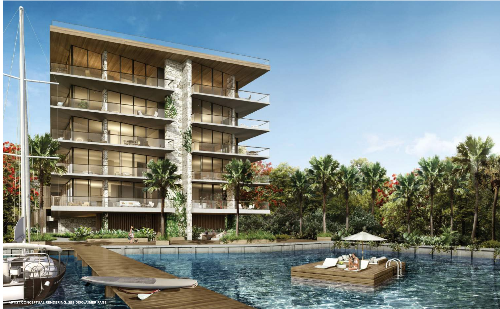
ARTIST CONCEPTUAL RENDERING. SEE DISCLAIMER PAGE