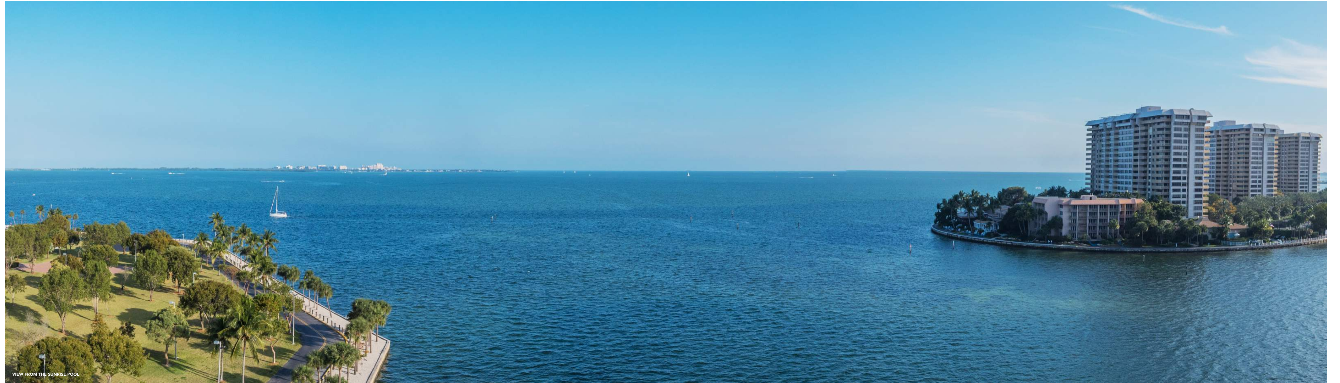
VIEW FROM THE SUNRISE POOL