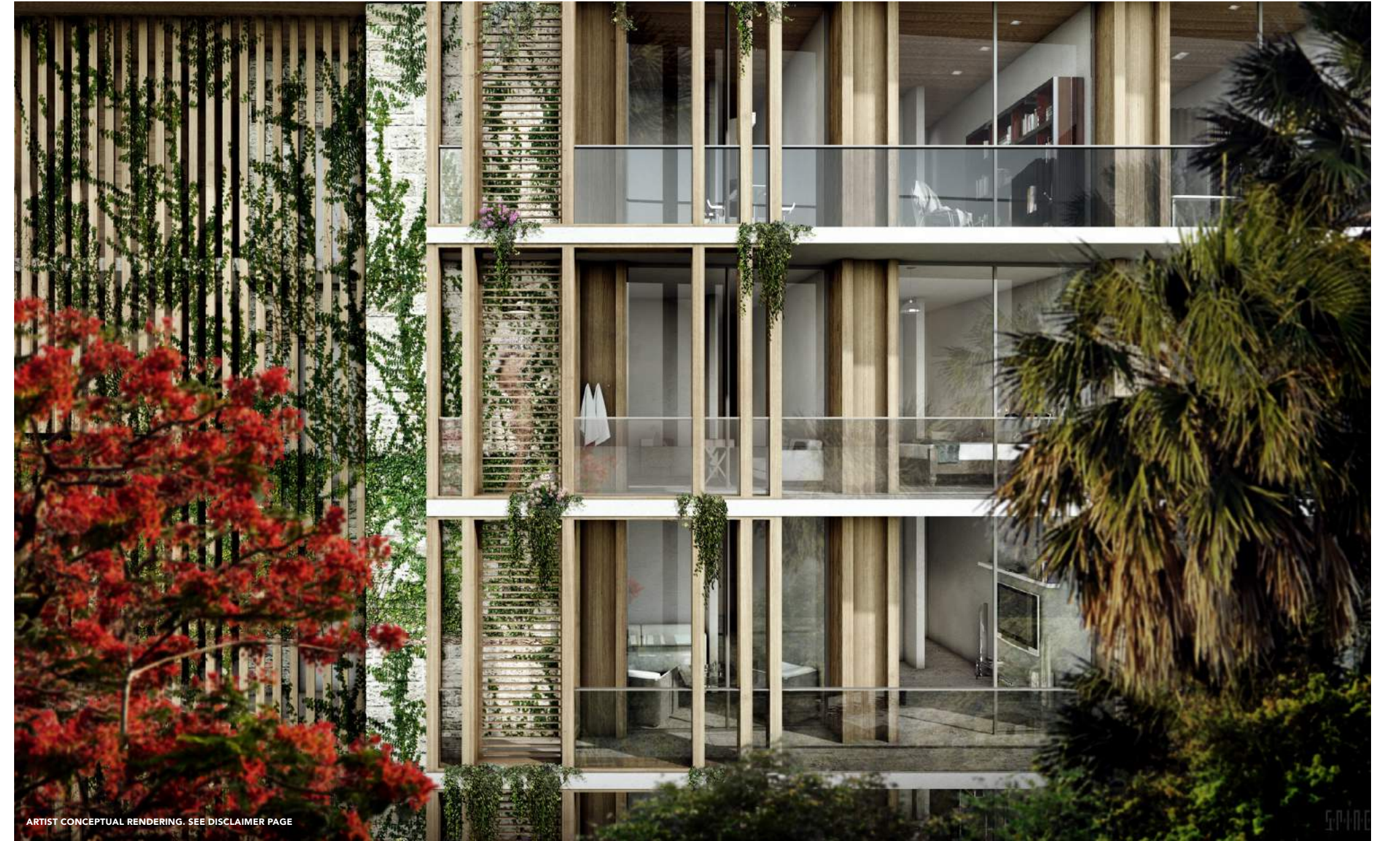
ARTIST CONCEPTUAL RENDERING. SEE DISCLAIMER PAGE