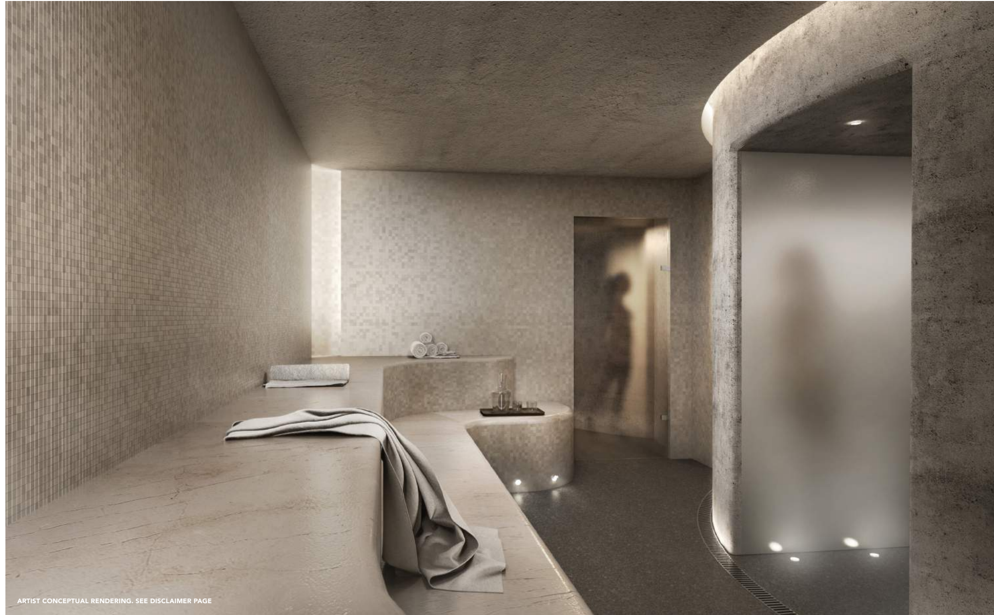
ARTIST CONCEPTUAL RENDERING. SEE DISCLAIMER PAGE